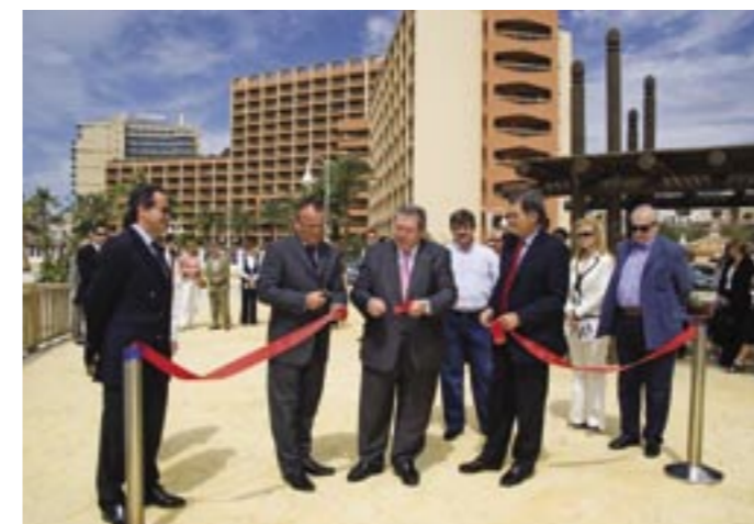
Mayor, Enrique Bolin officially opens the boardwalk Den officielle åbning af den nye paseo ved borgmester Enrique Bolin

There is secure, barrier parking for up to 220 cars, with special discounts for members.