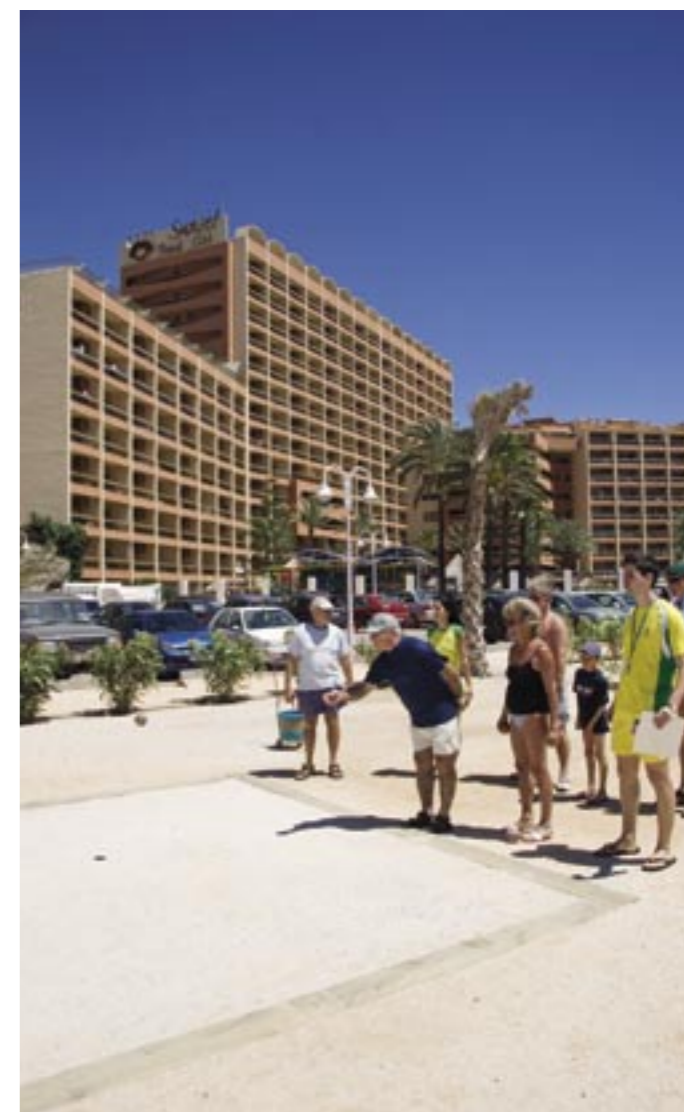
Lots of new activities on the prom! Mange nye aktiviteter på promenaden