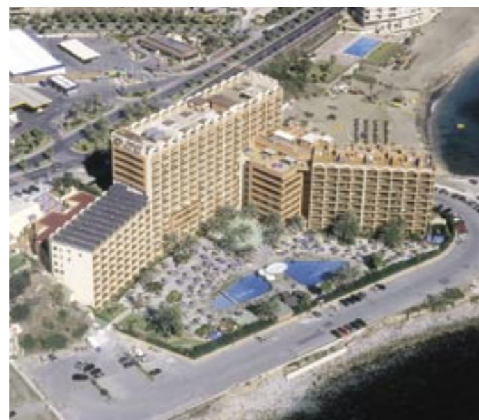
Before / Før After / Efter

Leisure Desk er åbent fra kl. 10 til 18 alle ugens dage.