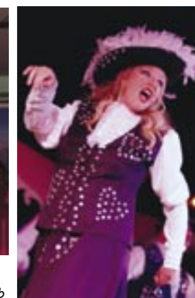
Plenty of shows to choose from at Sunset Beach Club Vi har mange shows at vælge imellem på Sunset Beach Club

Så er der showtime i Moonlight – se dem på scenen.