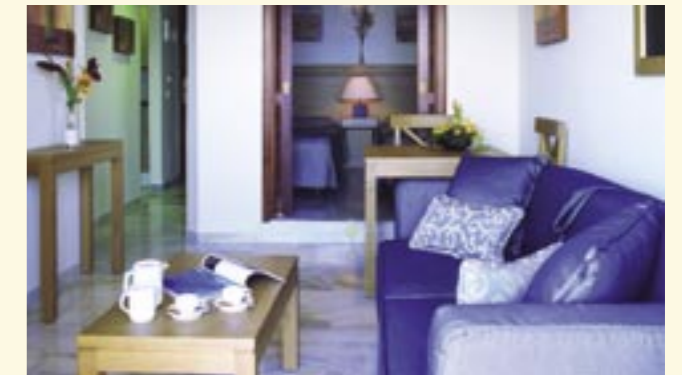
Stay in one of our newly refurbished units on our B & B offer! Prøv vores Bread & Breakfast tilbud og bo i en af vore nyrenoverede lejligheder»

Der kan foretages en reservation på tlf. 00 34 952 579 405/00 eller lokal 3026, hvis De er på resortet for at sikre Dem en hurtig bestilling til disse specialpriser. Se også vores website www.sunsetbeachclub.com eller skriv en e-mail til booking@sunsetbeachclub.com .