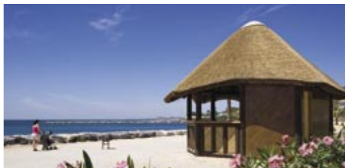
Sunset Beach Club Beach Bar Sunset Beach Club Strand Bar

Rafael siger: «Vi håber vores medlemmer vil tage godt imod vores nye menuer i vores restauranter og nye barer på paseoen, men den virkelige udfordring er at udvikle vort gode ry for god kundeservice samt konkurrencedygtige priser.»