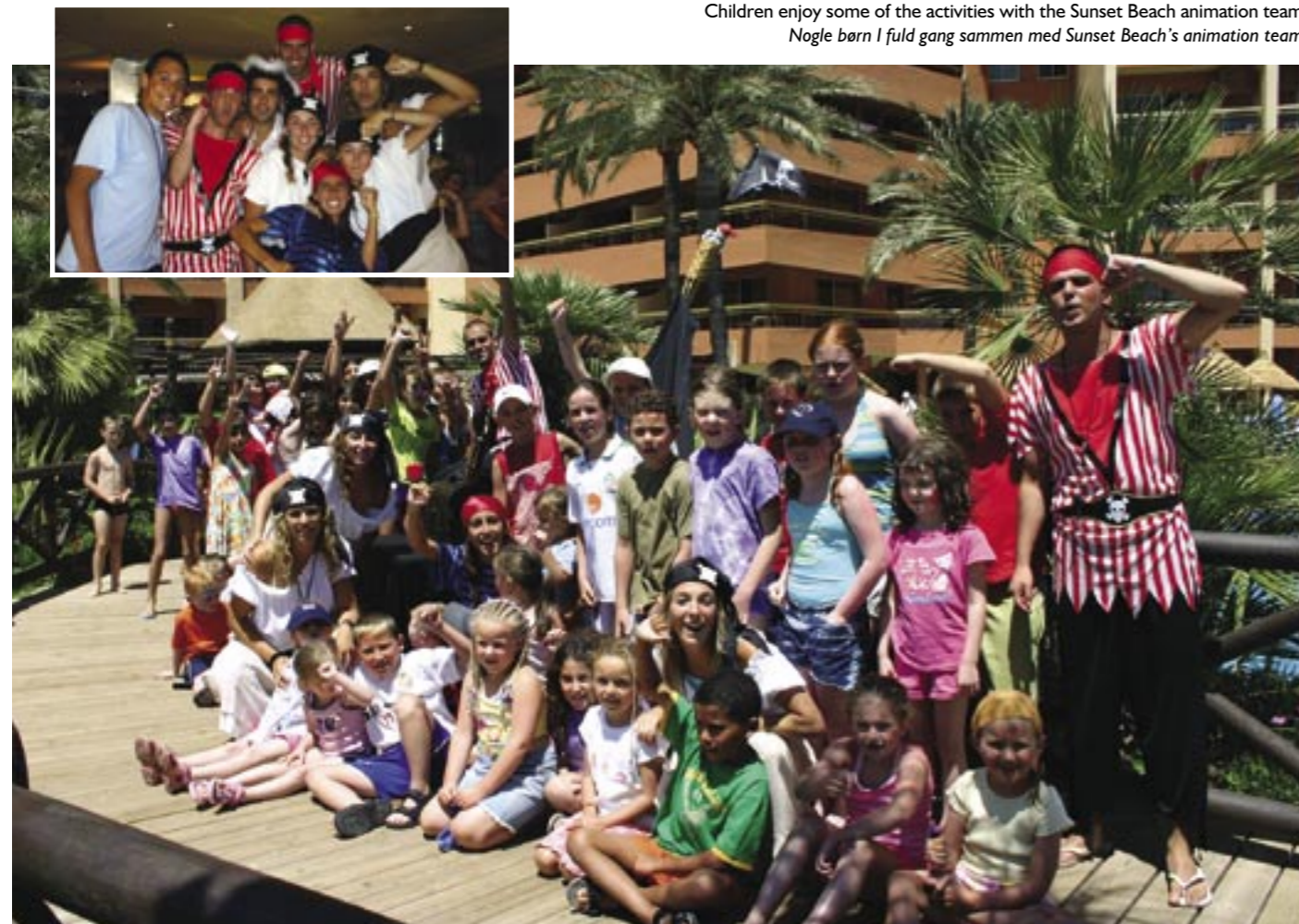
Children enjoy some of the activities with the Sunset Beach animation team Nogle børn i fuld gang sammen med Sunset Beach's animation team

Ved velkomstmødet hver søndag i Moonlight kan man få meget mere at vide. Festen begynder hver morgen kl. 10.