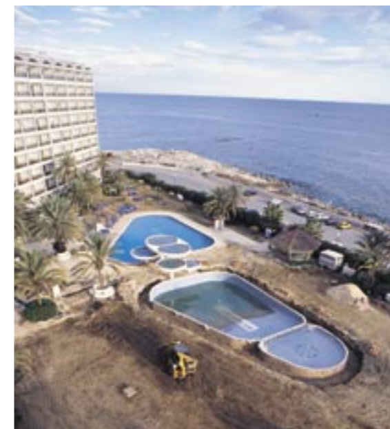
Before / Før After / Efter