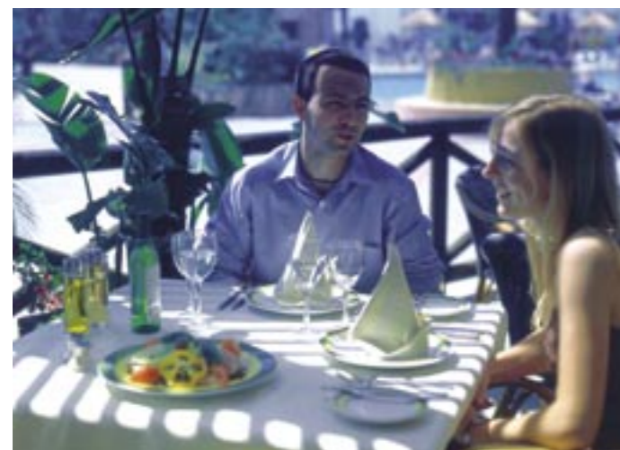
A Couple enjoys the new menu on the Terrace Restaurant Et par nyder den nye menu på The Terrace Restaurant

“New menus with something to appeal to everyone all day long.”