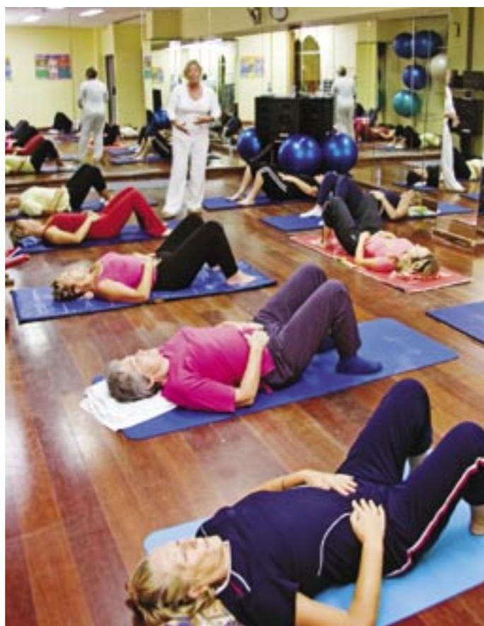
Classes continue to fill at Boyd's Fitness Centre Aktive hold i gang i Boyd's Fitness Centre