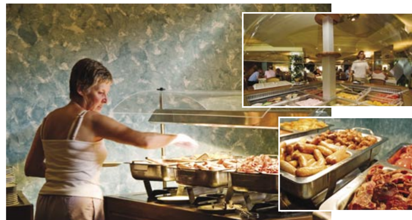
Members savour the choice at the resort's special breakfast buffet Mærk duften af morgenmadsbuffettens store udvalg

My verdict? I couldn't resist going back for more. And nice price too - five breakfasts for just 30 euros!