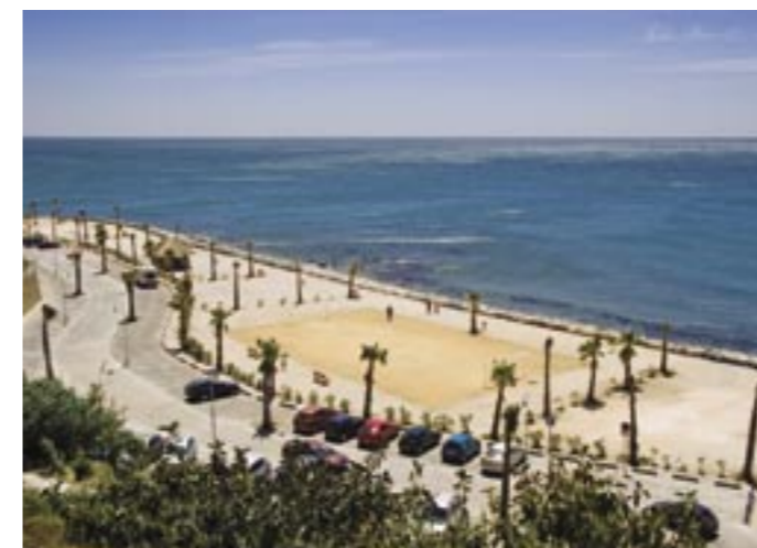
California comes to Spain...Sunset Beach Club Promenade....complete with palm trees Californien kommer til Spanien... Sunset Beach Club promenade.. med mange palmer